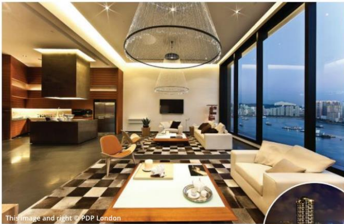
This image and right © PDP London