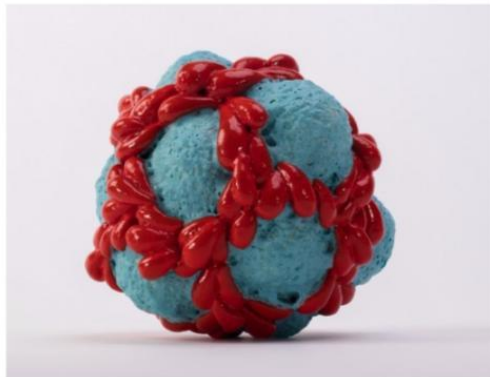
Bleeding Rain Cloud 2018 multiple glazed stoneware 20 x 20 x 20cm