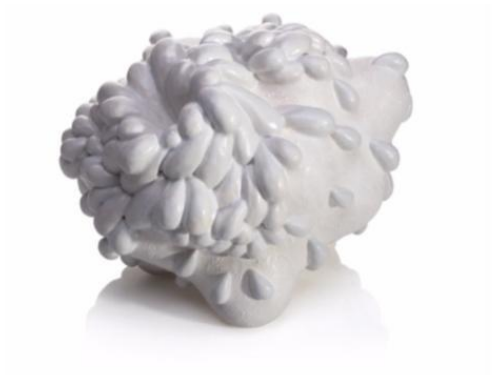
Cloudburst 2018 multiple glazed stoneware 30 x 31 x 20cm